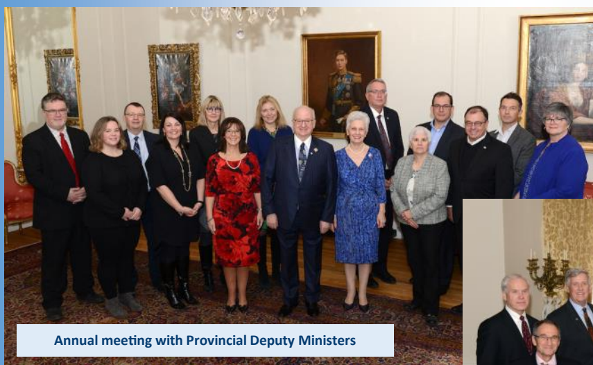
Annual meeting with Provincial Deputy Ministers

The Lieutenant Governor's Evenings @ Government House continued with 11 presentations on topics ranging from the centennial of Women's Suffrage in Nova Scotia to a presentation and exhibit by the Nova Scotia Potters Guild.