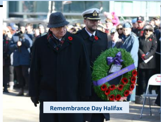
Remembrance Day Halifax