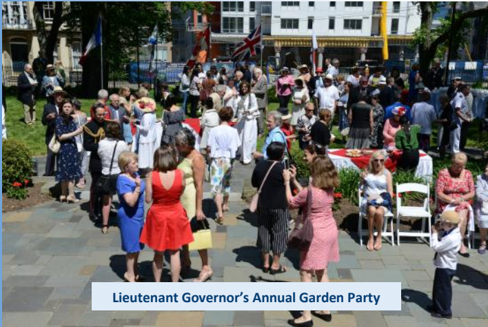
Lieutenant Governor's Annual Garden Party