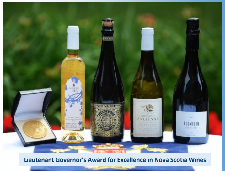
Lieutenant Governor's Award for Excellence in Nova Scotia Wines