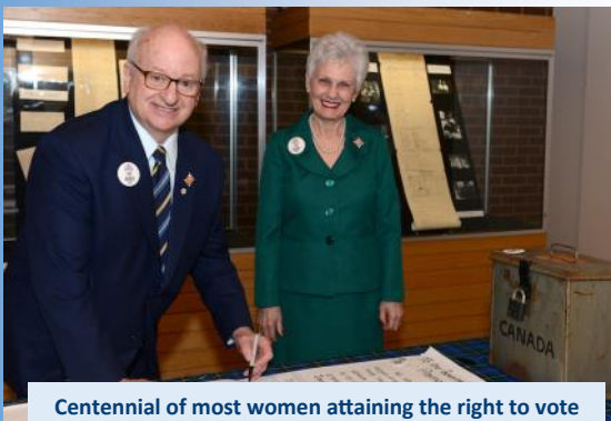
Centennial of most women attaining the right to vote