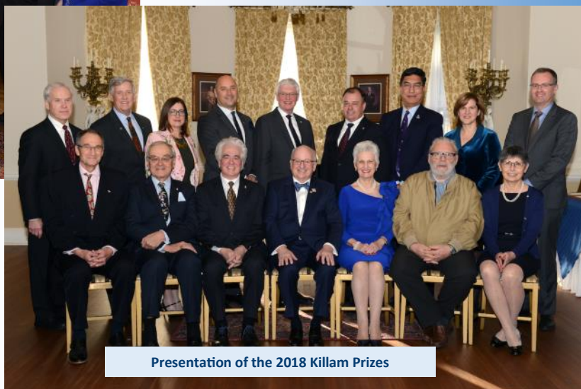
Presentation of the 2018 Killam Prizes