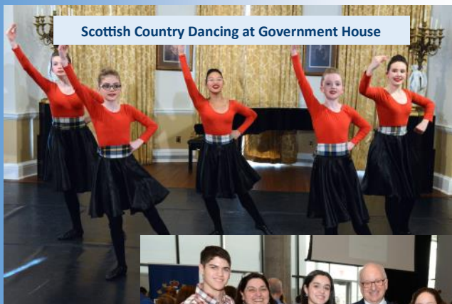
Scottish Country Dancing at Government House