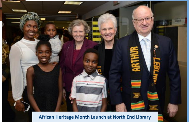
African Heritage Month Launch at North End Library