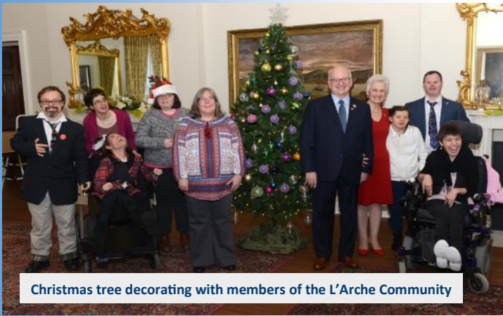
Christmas tree decorating with members of the L'Arche Community