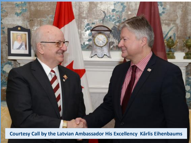
Courtesy Call by the Latvian Ambassador His Excellency Kārlis Eihenbaums