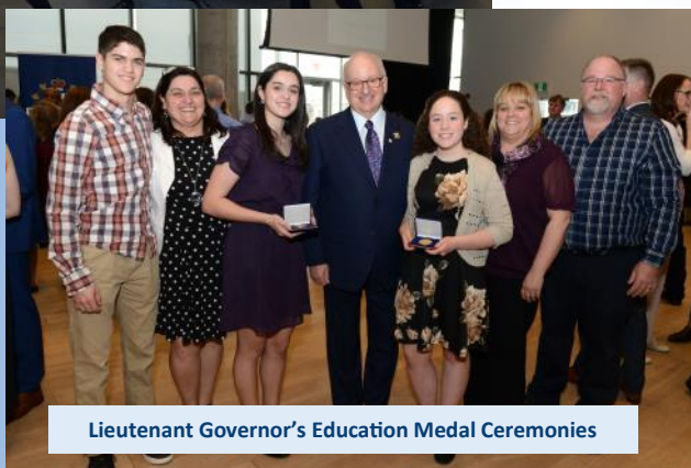
Lieutenant Governor's Education Medal Ceremonies