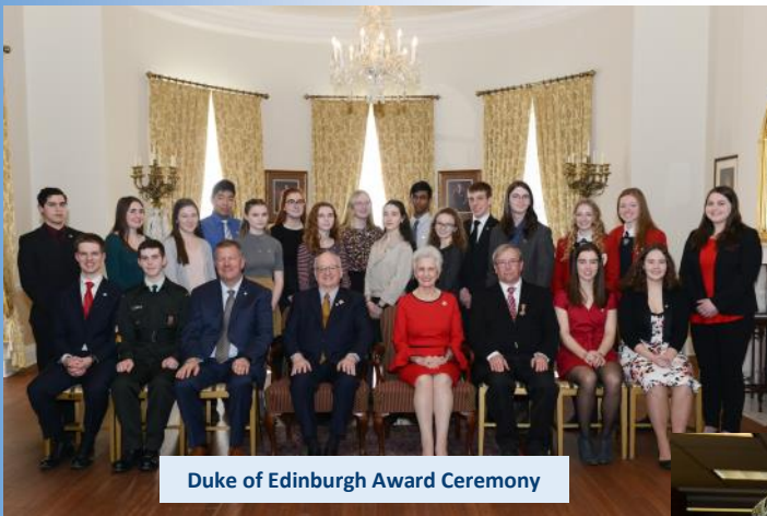
Duke of Edinburgh Award Ceremony

June 2018 saw the Lieutenant Governor officially welcome Her Excellency the Governor General to Nova Scotia on her first official visit since being sworn into office. The Governor General was in residence at Government House throughout the visit, and the overall programme was coordinated by the Office of the Secretary to the Governor General, Office of the Lieutenant Governor, Canadian Armed Forces and the Provincial Protocol Office.