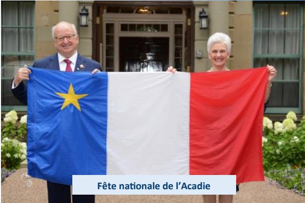
Fête nationale de l'Acadie