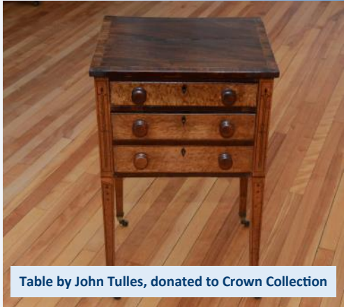
Table by John Tulles, donated to Crown Collection