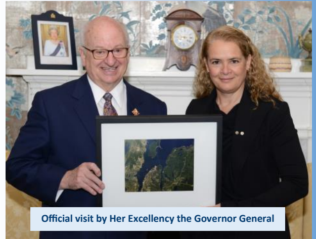
Official visit by Her Excellency the Governor General