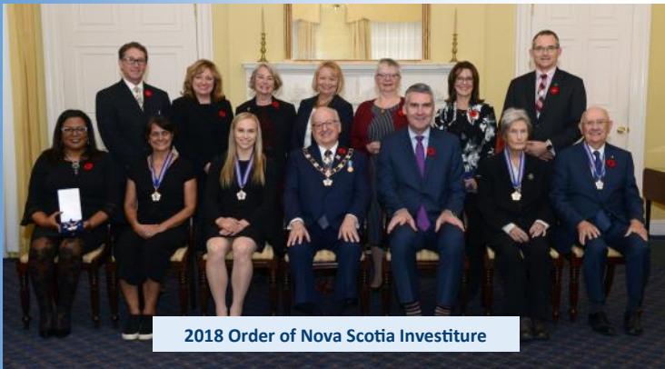
2018 Order of Nova Scotia Investiture

The hospitality category covers funds spent on foodstuffs and beverages served at official functions held by the Lieutenant Governor – either at Government House or at other venues where an official event is being hosted by the Lieutenant Governor. Operational/Administrative category covers expenses such as official gifts, musicians for events, hourly stipends for casual stewards who work formal dinners and other high-level functions.