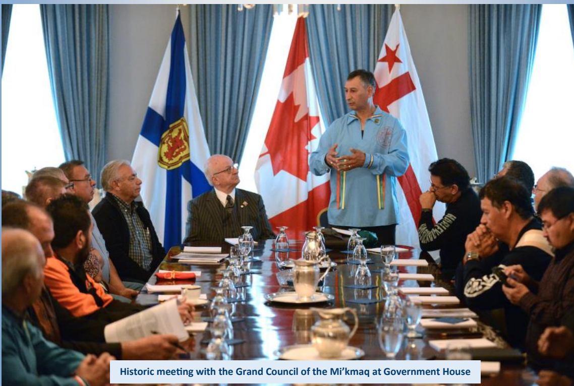
Historic meeting with the Grand Council of the Mi'kmaq at Government House

The Lieutenant Governor presided over one swearing in ceremony of the Executive Council, organized by Government House in co-operation with the Executive Council Office.